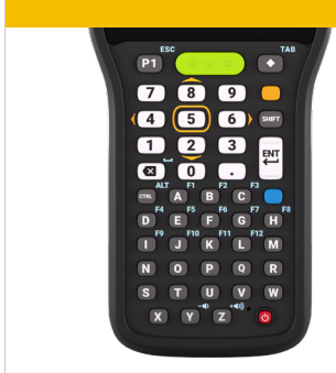
Alpha-Numeric (47 key)

Choose the keypad that best suits the type of data your workers need to capture