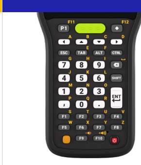
Function Numeric (38 key)