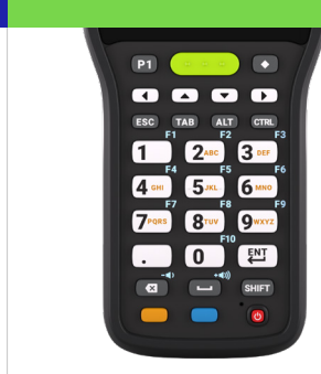
Numeric (29 key)