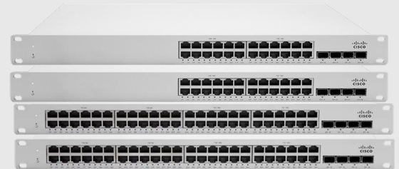
Cisco Meraki™ MS150 (24/48 port models)

A stackable access switch built to support Wi-Fi 7, IoT, and more.