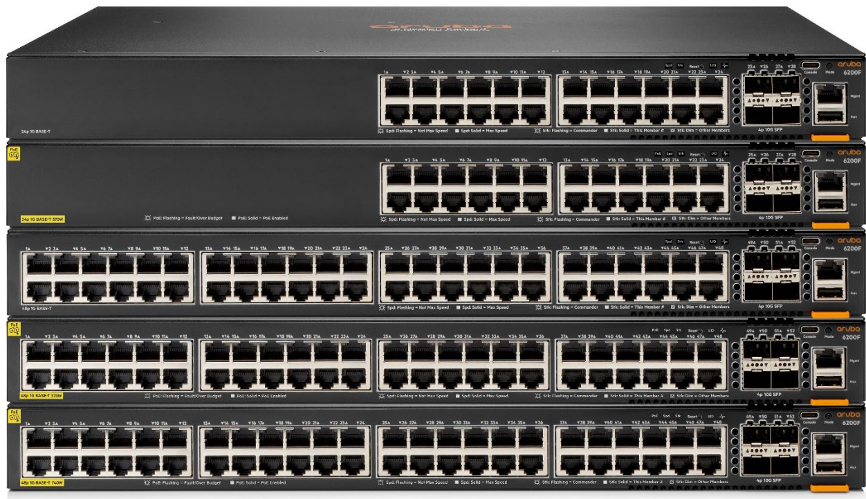
HPE Aruba Networking CX 6200 Switch Series

Aruba Dynamic Segmentation extends Aruba's foundational wireless role-based policy capability to Aruba wired switches. What this means is that the same security, user experience and simplified IT management can be enjoyed throughout the network. Regardless of how users and IoT devices connect, consistent policies are enforced across wired and wireless networks, keeping traffic secure and separate.