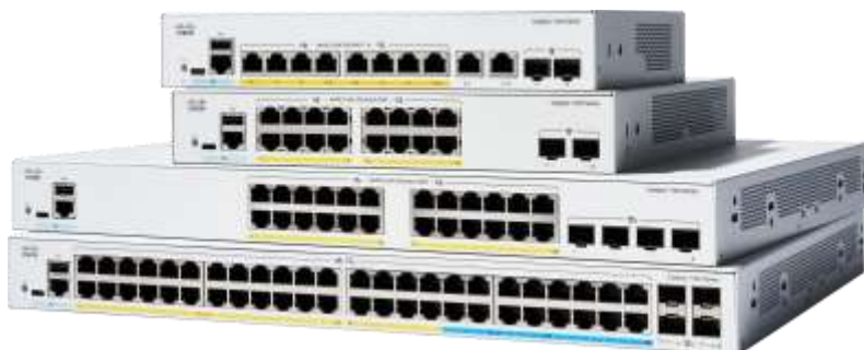
Figure 2. Cisco Catalyst 1300 Series switches

The Cisco Catalyst 1300 Series Switches are fixed, managed, enterprise-class Gigabit Ethernet Layer 3 switches designed for small and medium-sized business and branch offices. These simple, flexible, and secure switches are ideal for deployment out of the wiring closet. The Catalyst 1300 Series operates on customized Linux OS software, with an intuitive dashboard that simplifies network setup and advanced features that accelerate digital transformation, while pervasive security protects business-critical transactions. The 1300 Series switches provide the ideal combination of affordability and capabilities for small and medium-sized businesses and help you create a more efficient, better-connected workforce. When your business needs advanced networking features and security for the digital transformation, yet value is still a top consideration, you're ready for the Cisco Catalyst 1300 Series Switches.