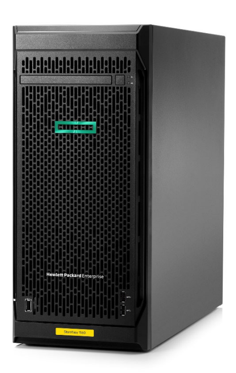
HPE StoreEasy 1560 Storage

HPE StoreEasy 1560 Storage solutions are built on a compact and affordable tower form factor package and deliver multi-protocol file serving and application storage to environments that don't have rack space, including small workgroups, small businesses, and remote offices. All HPE StoreEasy 1560 models come with the operating system pre-installed on the four internal LFF drives.