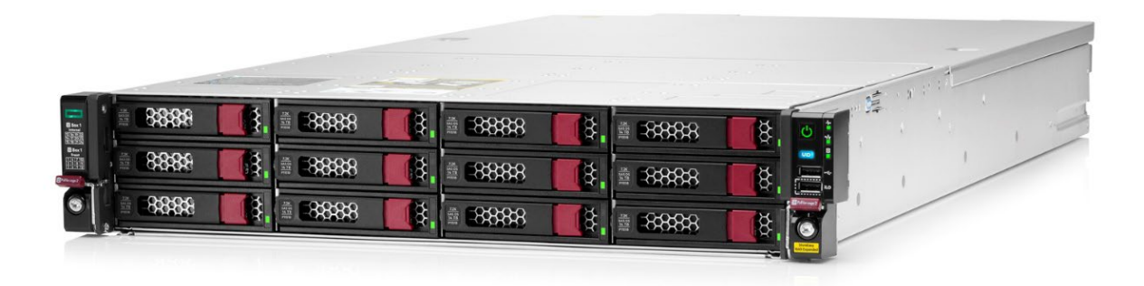
HPE StoreEasy 1660 Expanded Storage

The HPE StoreEasy 1660 Expanded Storage is a density-optimized (with 28 LFF hot-plug drive slots) 2U rack-mount form factor platform ideal for bulk file and secondary storage workloads. All StoreEasy 1660 Expanded models come with the operating system pre-installed on mirrored solid state drives.