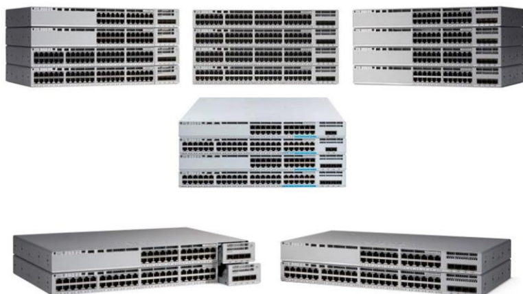
Figure 1. Cisco Catalyst 9200 Series switches

The Cisco Catalyst 9200 Series is made up of modular (C9200), fixed (C9200L) and compact (C9200CX) switch models.