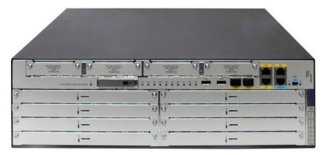
HPE FlexNetwork MSR3064 Router - Front