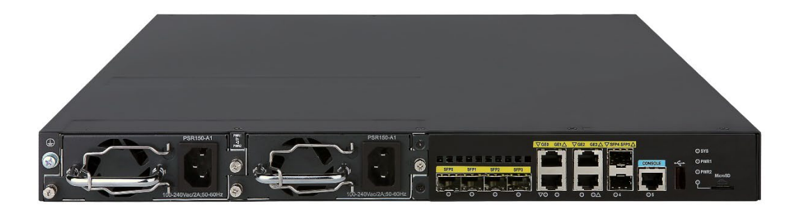
HPE FlexNetwork MSR3620-DP Router - Front