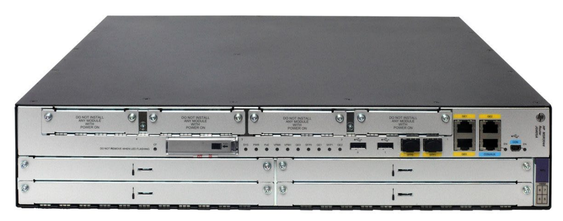
HPE FlexNetwork MSR3044 Router- Front