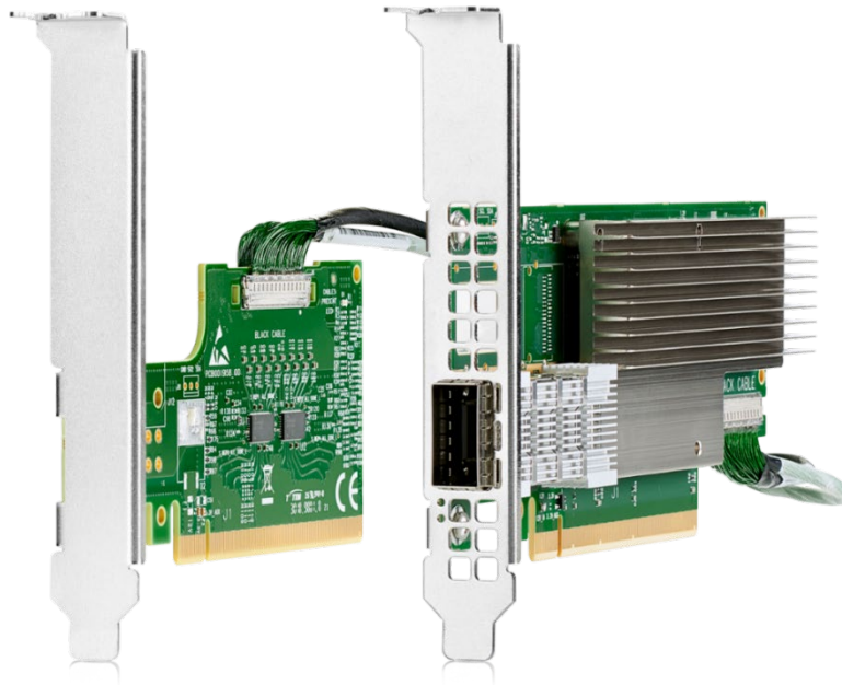
P/N P06154-H21, P06154-H21, P23664-B21, P23664-H21 (HDR 1-port ConnectX®-6) + P06154-H22/23 with Gen10