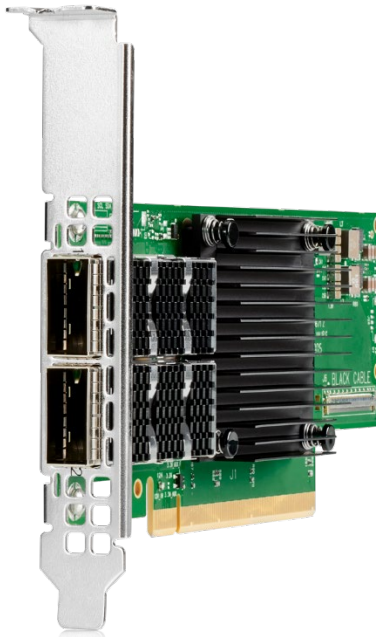
P/N P06251-H21, P06251-H21, P23666-B21, P23666-H21 (HDR100 2-port ConnectX®-6)