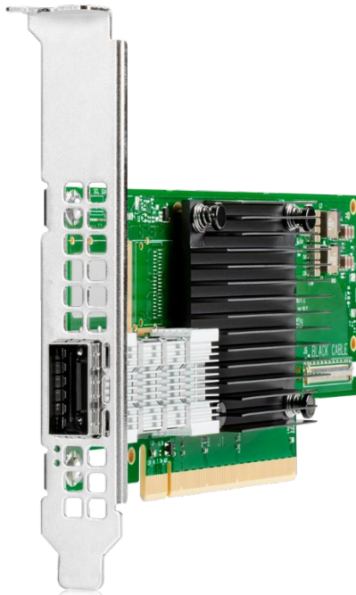
P/N P06250-H21, P06250-H21, P23665-B21, P23665-H21 (HDR100 1-port ConnectX®-6)