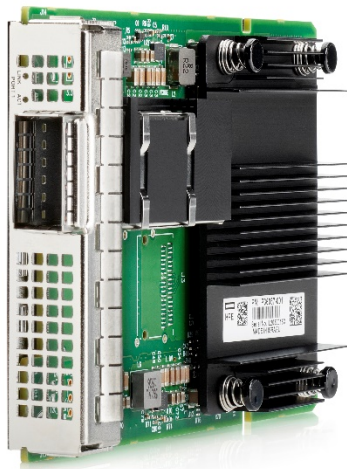
P/N P31323-B21, P31323-H21 (for Gen10 Plus only)

HPE HDR InfiniBand 200Gb 1-port QSFP56 and HPE HDR100 InfiniBand 100Gb 1 or 2 port QSFP56 Adapters are supported on HPE ProLiant Gen10 Plus servers and HPE ProLiant Gen10 servers but a different part number is to be ordered based on server generation. They are industry standard adapters with no HPE customization when used with HPE ProLiant Gen10 Plus servers. They are HPE versions developed on HPE specifications when used with HPE ProLiant Gen10 servers. Differences from the industry standard versions are primarily related to the management features implemented in the firmware. HPE HDR InfiniBand 200Gb 2-port QSFP56 and HPE HDR InfiniBand 200Gb 1 or 2 port QSFP56 OCP3 Adapters are supported on HPE ProLiant Gen10 Plus servers only.