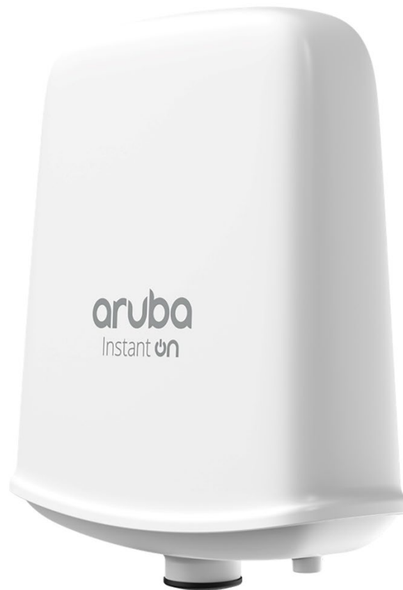
Aruba Instant On AP17 Outdoor Access Points

The Aruba Instant On AP17 outdoor access point is the ideal solution for expanding coverage and signal strength for any wireless network. The outdoor-rated enclosure is designed for harsh outdoor environments, extending quality Wi-Fi to outdoor seating areas in restaurants and cafés, or patios and swimming pools in boutique hotels.