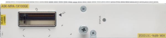
Figure 4. Cisco ASR 9000 Series 1-port 100G modular port adapter