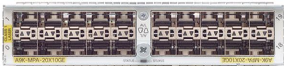
Figure 2. Cisco ASR 9000 Series 20-port 10G modular port adapter